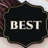
Seafood Fried Rice