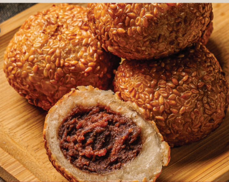
Sesame Red Bean Ball