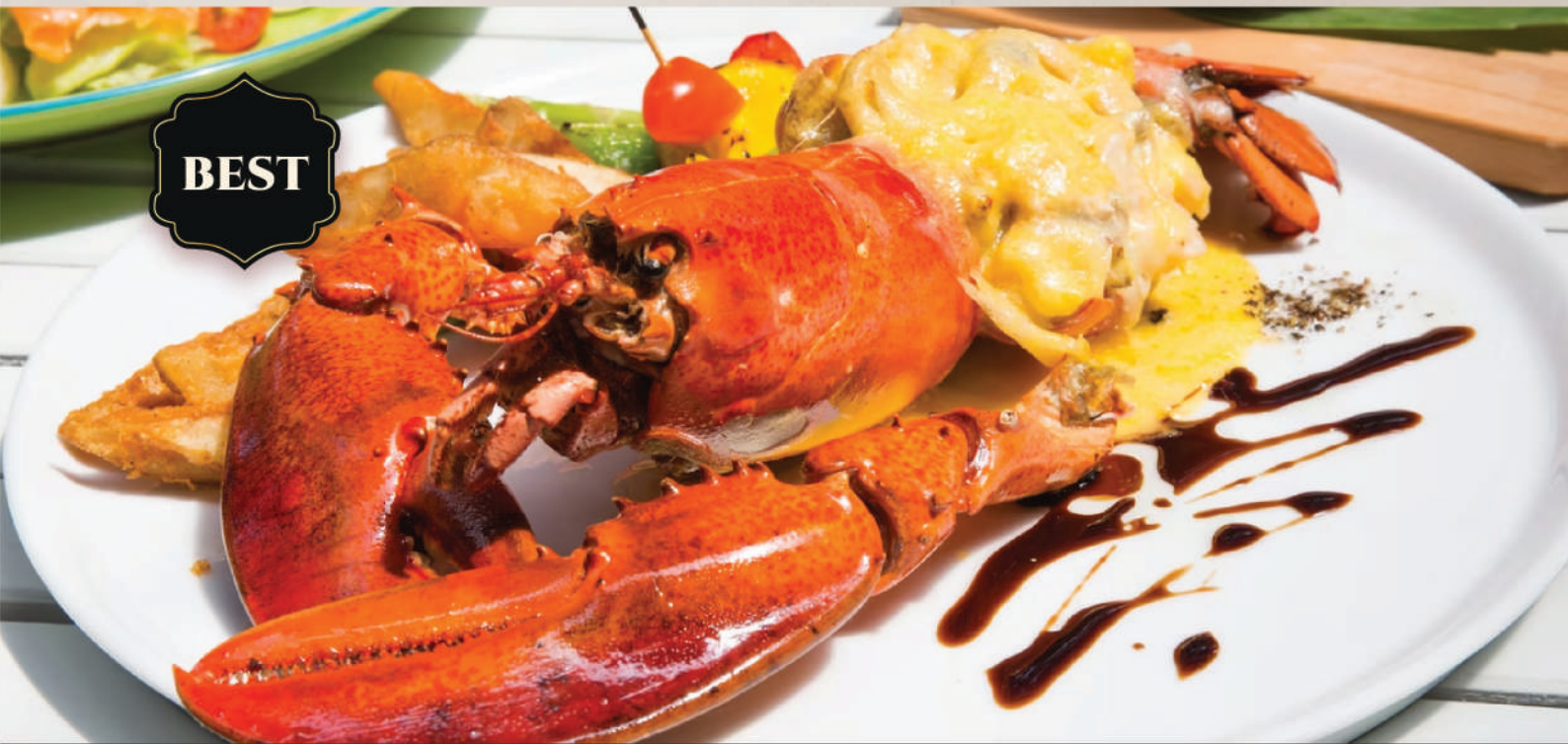
CHILI SAUCE LOBSTER