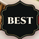
Kung pao Beef