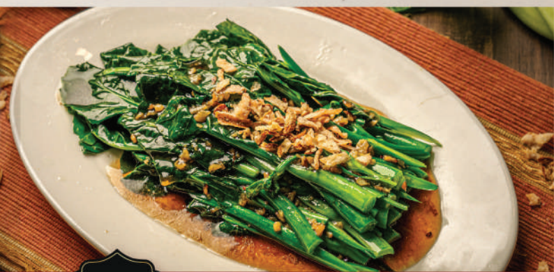
Broccoli Black Mushroom