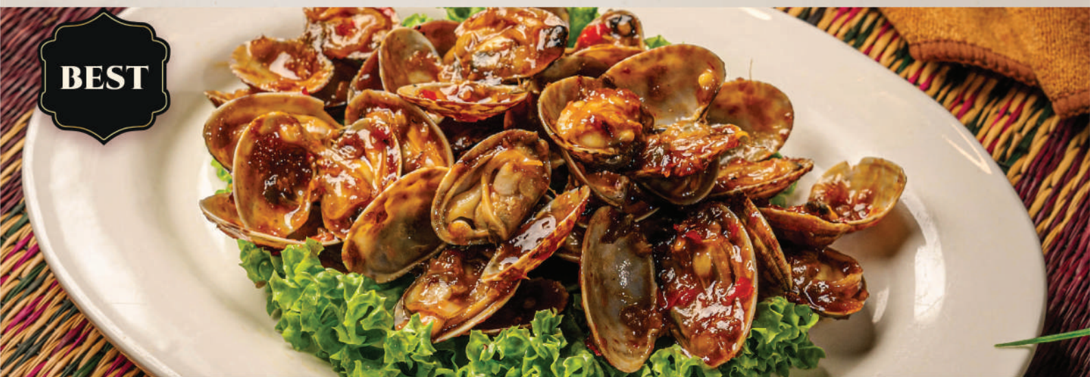
KAM HEONG ASARI