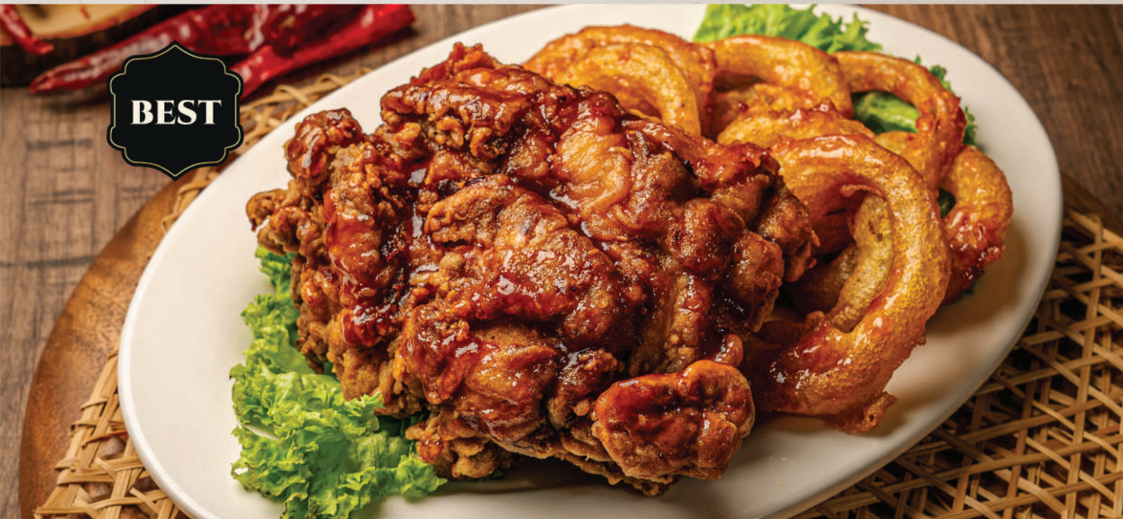
Onion Ring Chicken