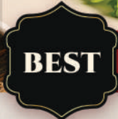
Kam Heong Beef